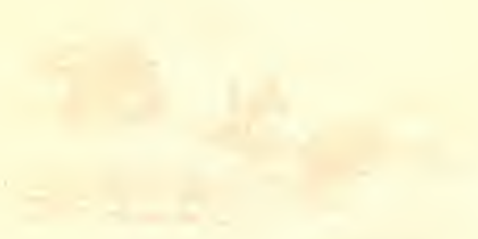
Graylock from the North